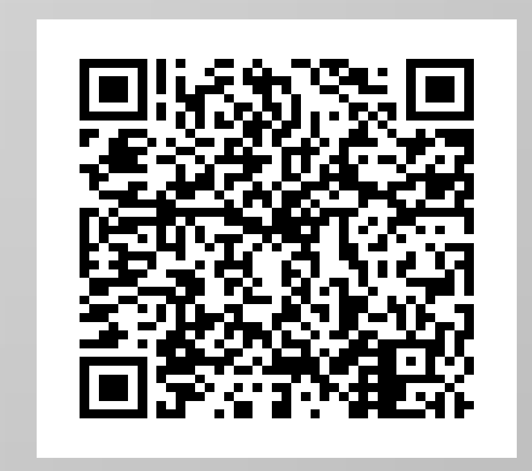
The Touch of a DO – Original Paper

The importance of touching patients and treating the whole person is the most important lesson learned from this observation