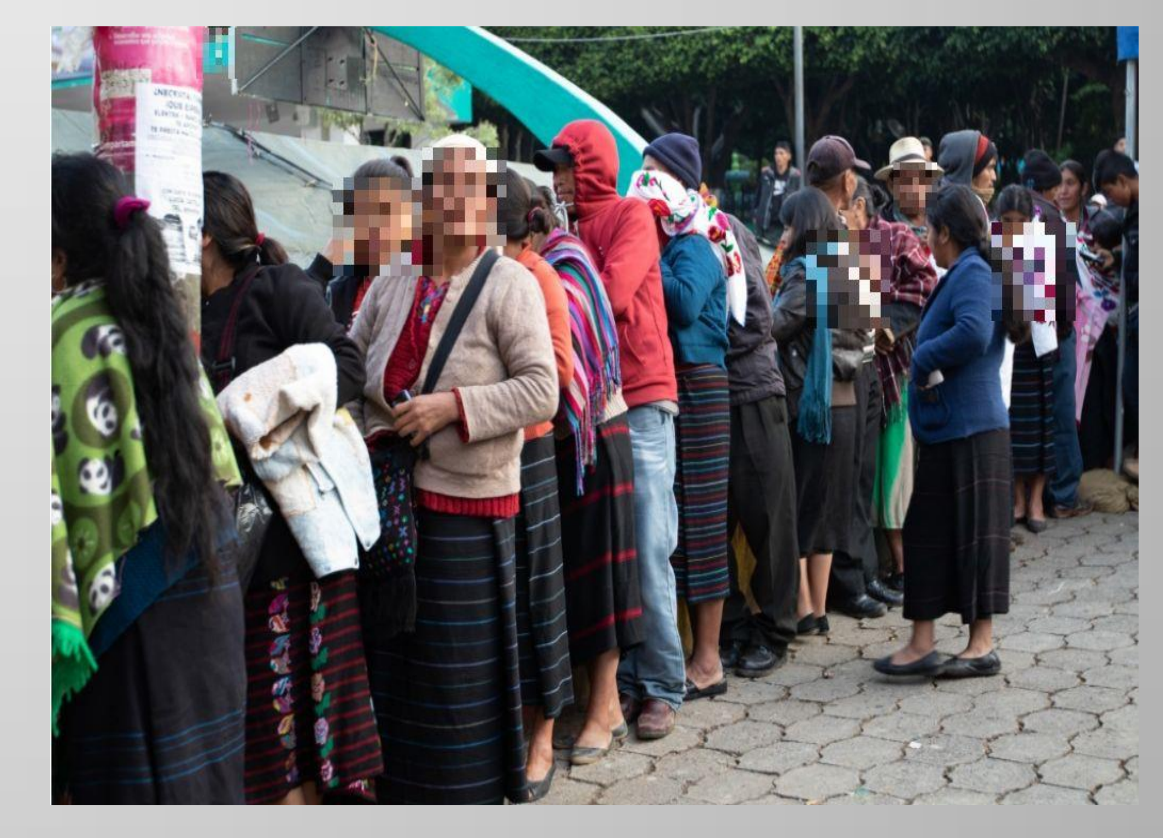
Patient volume increased by 500 patients on second clinic day

Left impressed with the experience and shared with his family and friends his positive experience with touch in the physical exam and hands-on treatment approach