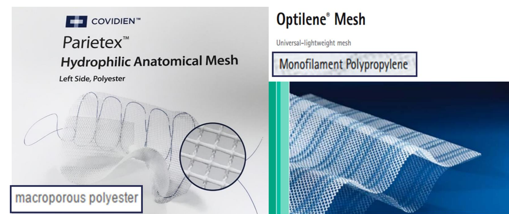
Figure 1: Patients are provided the Polypropylene Mesh at no additional cost but are provided the option of purchasing a higher performing Polyester Mesh for an additional 500$. All patients, regardless of whether they chose the Polypropylene Mesh or self-paid Polyester Mesh, are charged a flat co-pay of 70$.

The goal of this study is to help physicians make evidence-based decisions when counseling patients prior to the procedure.